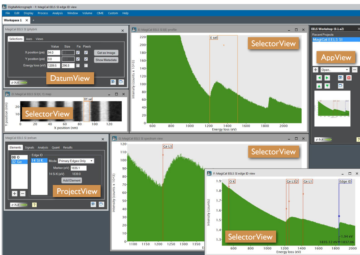
Figure 2. Snapshot of an active EELS spectrum image data set analysis using EELS Workshop, a typical realization of Enabler’s Workshop App design pattern. All view and ROI actions are conveyed to the project via the underlying network of controller objects depicted in the class diagram.